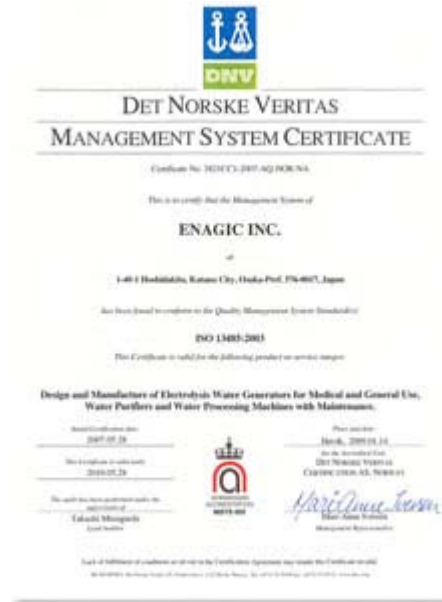
Management System Certificate ISO 13485:2003