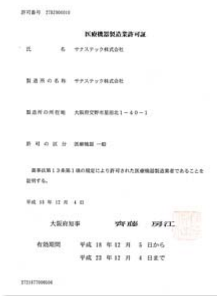
Manufacturing license of Medical Device by Osaka Prefecture. License Number: 27BZ006010