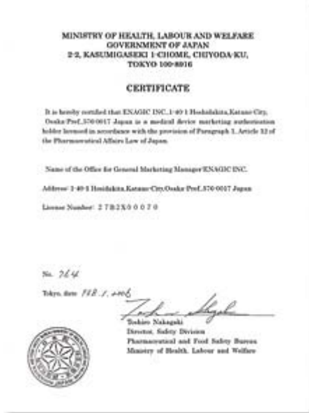
Certificate of Medical Device Marketing Authorization by Ministry of Health, Labour and Welfare, Government of Japan. License Number: 27B2X00070