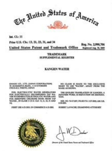
Registration certificate of Kangen Water by United States Patent and Trademark Office.